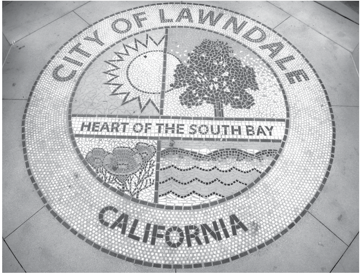
Facing the Community Center, outside of Lawndale's City Hall in a courtyard surrounded by benches, lays this colorful mosaic display of city pride.